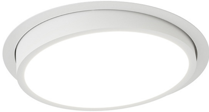
Satin Ice (SI) Flat Lens and 5° vertical tilt shown.